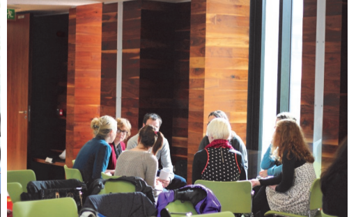
Scholars, alumni and academics from 7 national HEI's collaborating and sharing their vision for the SPHeRE Network